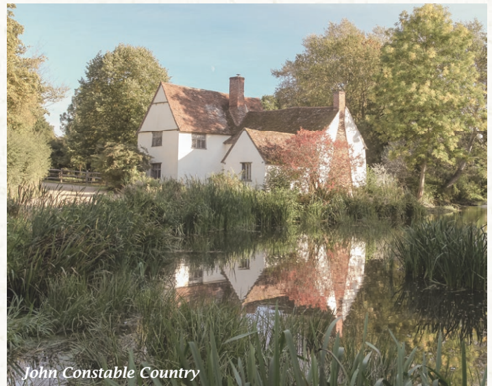
John Constable Country