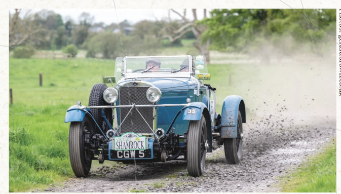
Andrew and Ann Boland, 1934 Talbot AV105

sweeps will be taking a good look at both of them. Delicious coffee and cake was served in the Piggery Cafe at the Time Control in Swainstown Farm after which the Swainstown Test shot the rally out of their pastoral idyll via a series of gravel roads with some square turns thrown in. The loose surface, tight corners and a pirouette through the trees were savoured as much as the refreshments and